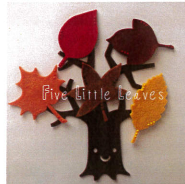
Five Little Leaves (Sung to the tune of: Six Little Ducks)

Five little leaves were hanging in a tree Red, orange, yellow, green, pretty as can be. Whoosh, came a breeze of cold fall air, And only four little leaves were left hanging there.